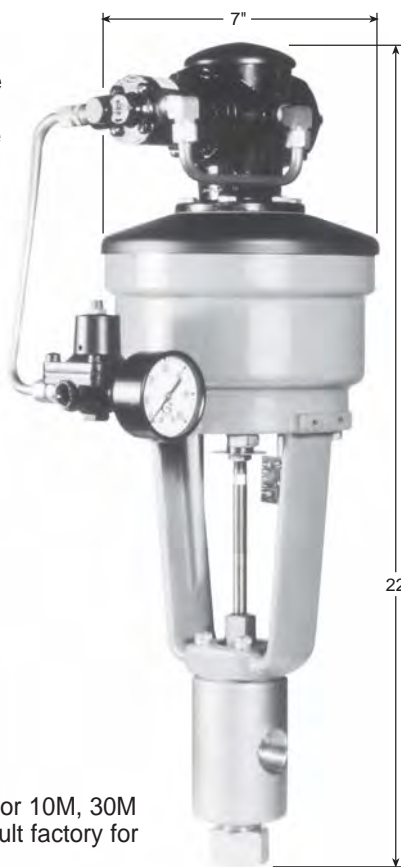
Dimensions shown for 10M, 30M and 60M size. Consult factory for 20M dimensions.