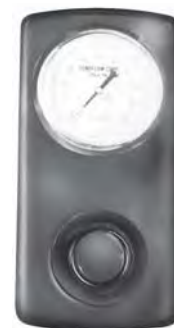
Remote Valve Stem Positioner "RVP" above permits remote positioning of valve stem in increments of 0.0112". To order, add suffix "RVP" to base order number.