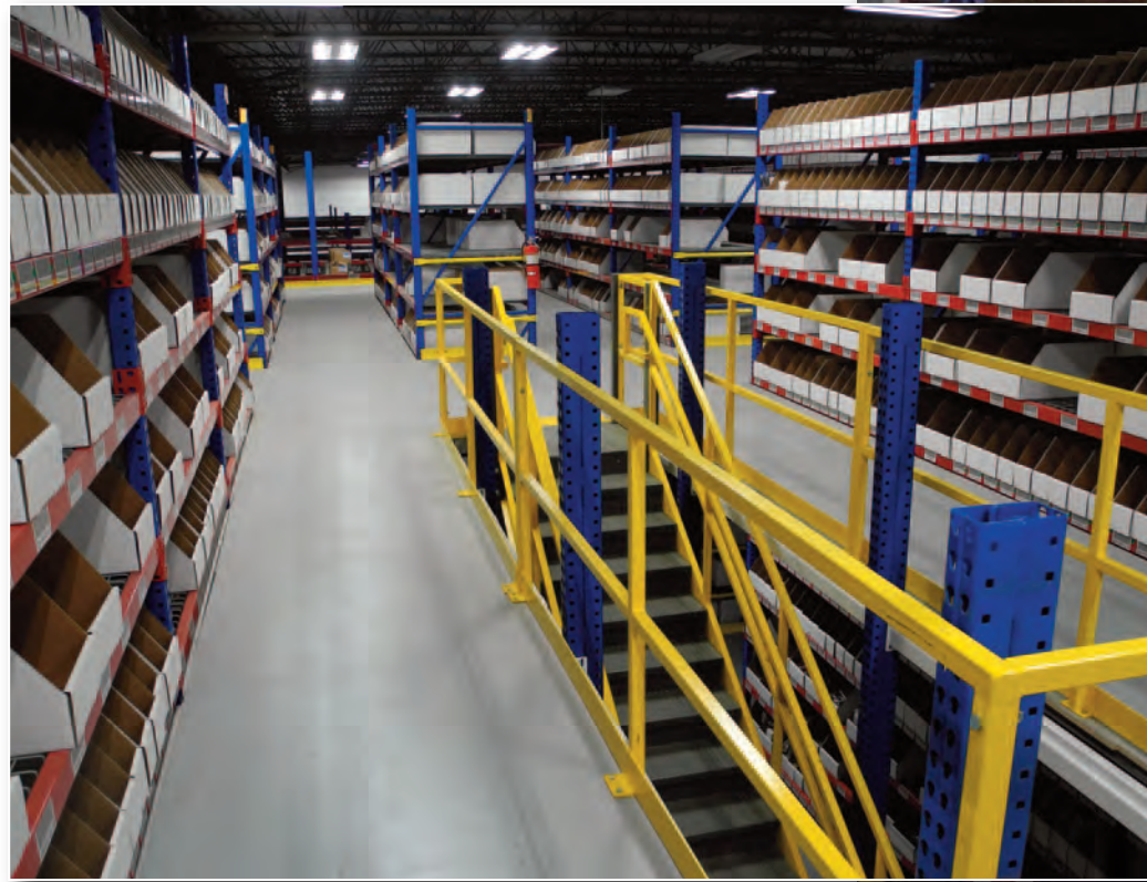
An automotive distribution center houses more than 20,000 SKUs with a massive parts picking fulfillment structure.