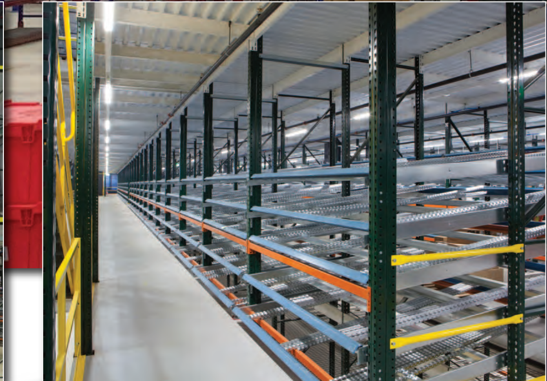
Ridg-U-Rak engineers pick modules incorporating customer specified components like this carton flow systems.