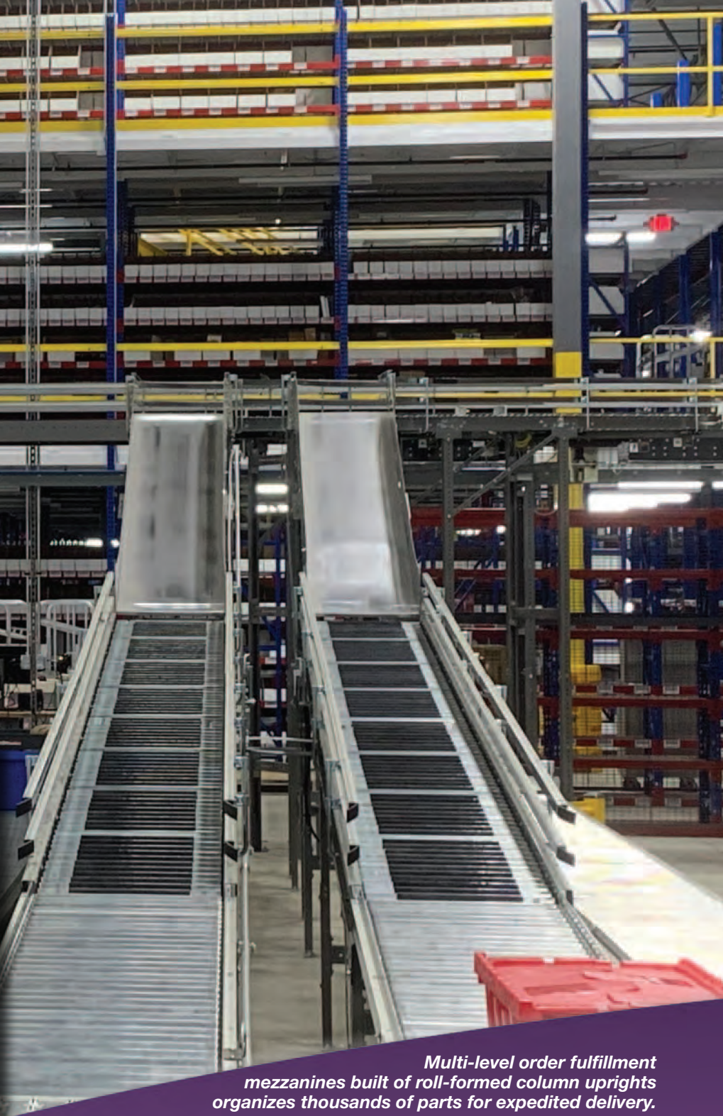
Multi-level order fulfillment mezzanines built of roll-formed column uprights organizes thousands of parts for expedited delivery.