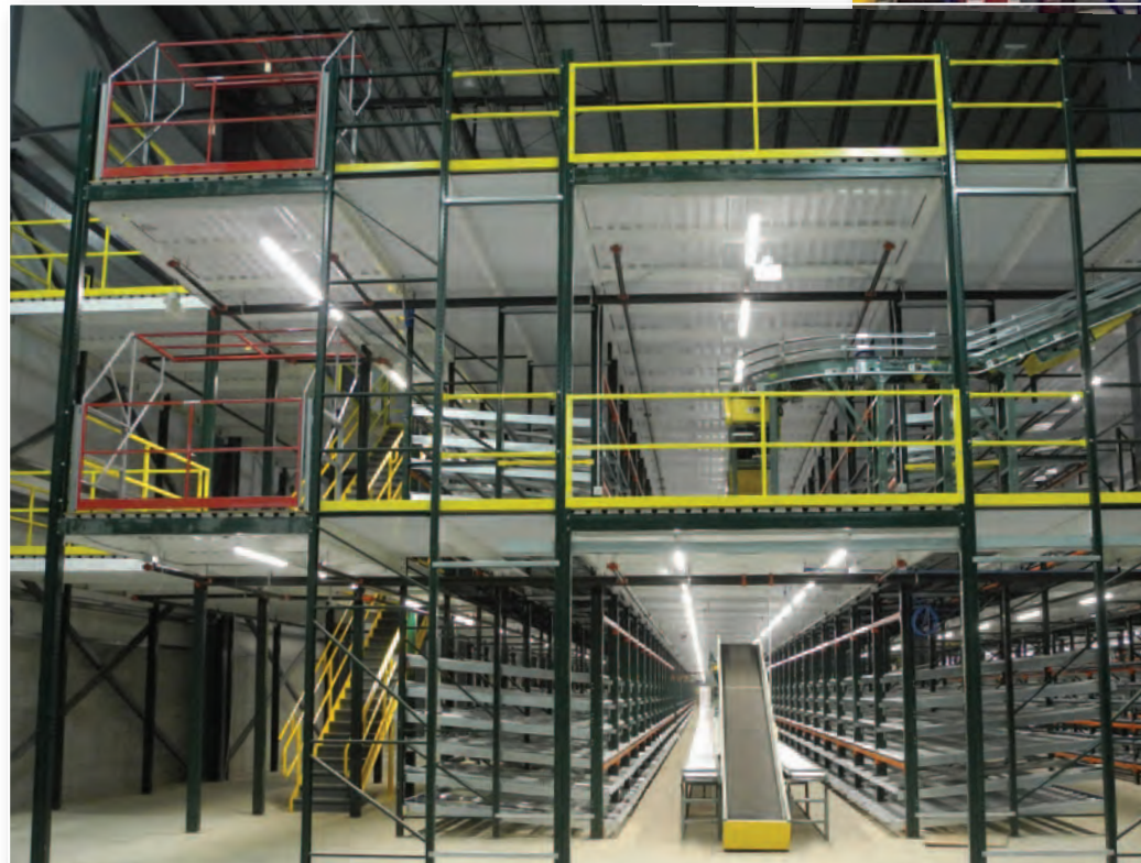
This multi-level fulfillment module incorporates carton flow, conveyors and pallet replenishment storage. Each level includes safety gates.