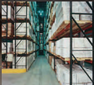
Very Narrow Aisle